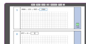
Key Stage 2 Arithmetic Paper

SATS-papers - This website is a gold mine! It is free to sign up and contains all the previous SATs papers, with answers and most importantly worked examples. We have used this in class and it has been a game changer! By going through the papers and showing the children “worked examples/solutions” they are able to see how to answer the questions and also reflect where they may have made a mistake or could have used an easier method. I am not suggesting they do all the SATs papers but the worked solutions are a really great tool!