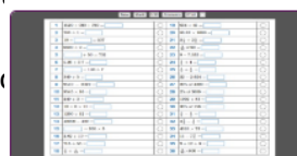
Key Stage 2 Arithmetic - Compact