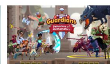
Guardians: Defenders of Mathematica - SATs game