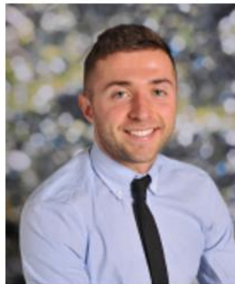
Tempest © Joe Noblet – Class Teacher, Back up DSL